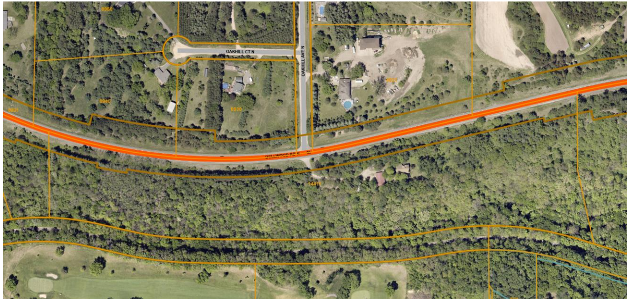
Figure 1: Subject property and neighboring areas, per County GIS. Parcel lines are in orange, tan/brown is ROW